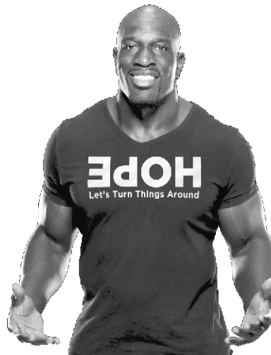
WWE Superstar Titus O'Neil

For holiday information call: Para más información llama: 727.937.3268