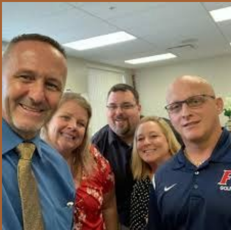
FIVAY ADMINISTRATION TEAM!