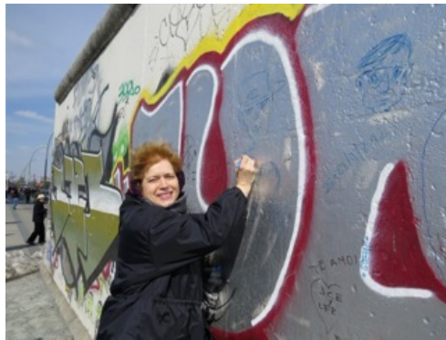
Berlin Wall, Berlin Germany