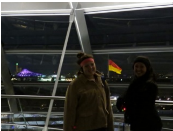
Reichstag Building Dome, Berlin Germany