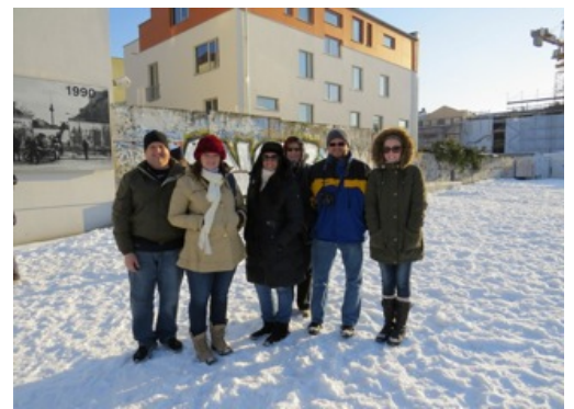
Berlin Wall, Berlin Germany