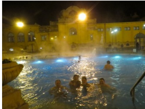
Thermal Baths, Budapest Hungry