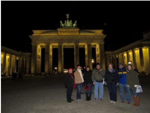
Bradenberg Gate Berlin Germany