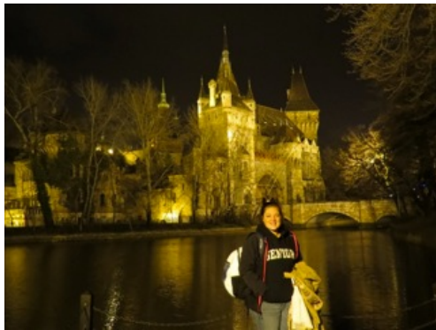
Vajdahunyad Castle , Budapest Hungry